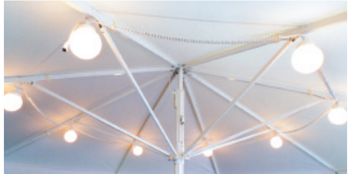
8-string globe lighting

The giant sunshades may be equipped with internal wiring for lighting. Globe lighting attached to the ribs or a 220v fluorescent lamp attached to the mast is available, depending on model or size of umbrella. For storage, the globe string lighting should be removed from frame.